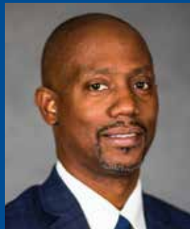
Lumon May Commissioner, Escambia County