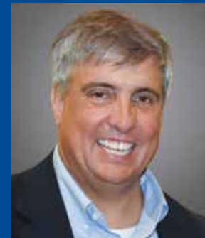
Mayor Grover Robinson IV City of Pensacola