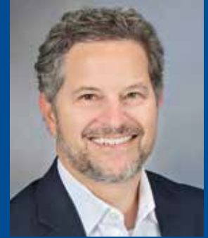
Kramer Litvak Litvak, Beasley, Wilson and Ball